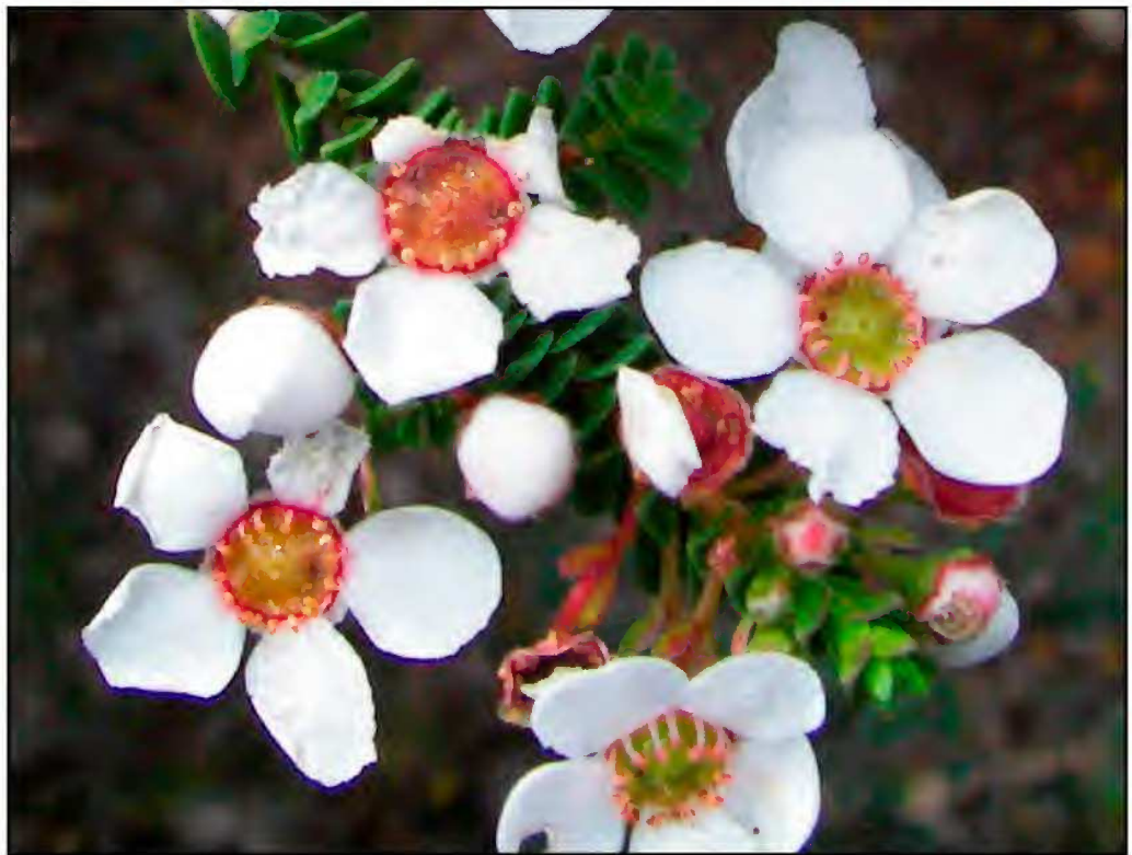
Figure 3. Anticoryne ovalifolia flowers. (voucher B.L. Rye BLR 279045).

Diagnostic features. Distinguished from the other species of Anticoryne by its more lacinate, often broader leaves, more widely spaced stamens, and more ovoid anthers.